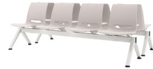
V-Care bench 4U