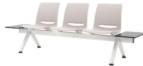
V-Care bench 3U TE2 H: 820 mm W: 2300 mm D: 610 mm