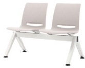
V-Care bench 2U H: 820 mm W: 1100 mm D: 610 mm