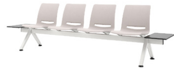
V-Care bench 4U TE2 H: 820 mm W: 2870 mm D: 610 mm