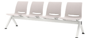
V-Care bench 4U H: 820 mm W: 2250 mm D: 610 mm