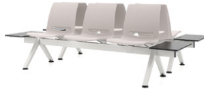
V-Care bench 3UTE2