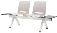
V-Care bench 2U TE2 H: 820 mm W: 1730 mm D: 610 mm