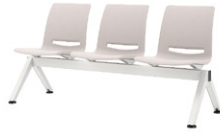
V-Care bench 3U H: 820 mm W: 1680 mm D: 610 mm