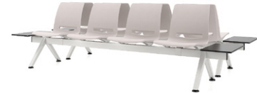
V-Care bench 4UTE2