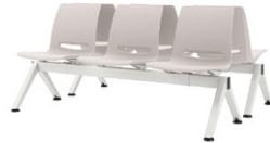
V-Care bench 3U