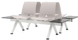
V-Care bench 2UTE2