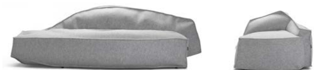
AIRBERG Sofa & Easy Chair By Jean-Marie Massaud