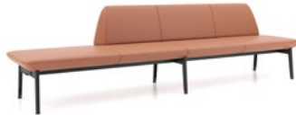
Genaya sofa 4U 3B, freestanding/for integration Available versions: right and left H: 815 mm W: 3070 mm D: 670 mm