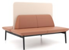
Genaya sofa 2U / 2U 4B PN, freestanding/for integration H: 880/1205 mm* W: 1660 mm D: 1375 mm