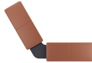
Genaya table top A120 W: 495/385 x 495/385mm** D: 560mm