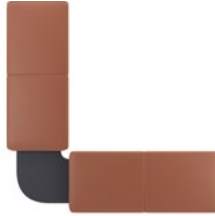
Genaya table top A90 W: 705/595 x 705/595mm** D: 595mm