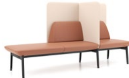
Genaya sofa 3U 2B PN, freestanding/for integration Available versions: right and left H: 880/1205 mm* W: 2395 mm D: 705 mm