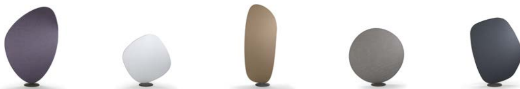
WIND Room divider By Jin Kuramoto